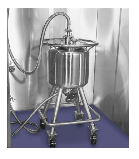
Vessel in Enclosure for SIP