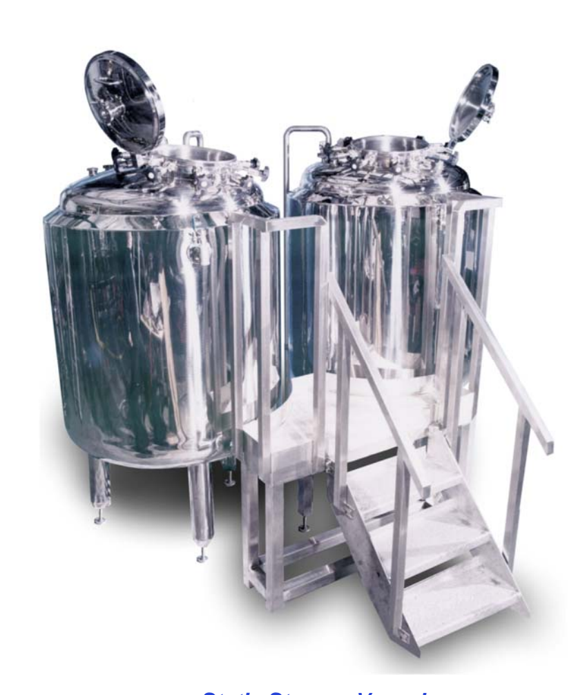
Static Storage Vessels