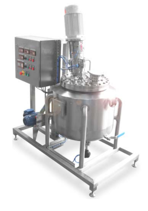
Mixing Vessel Skid