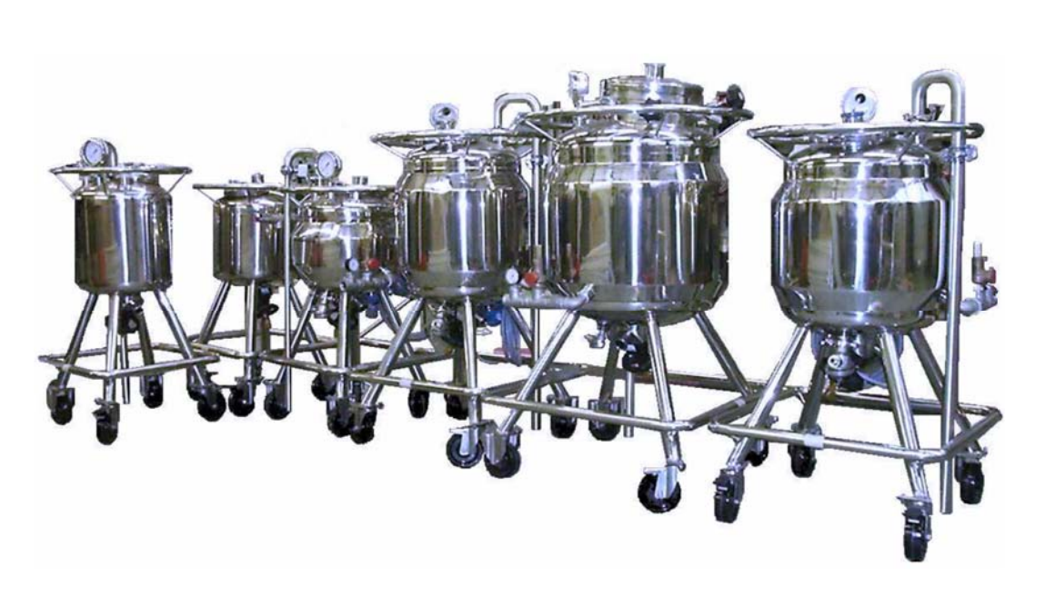
Mobile Pressure Vessels