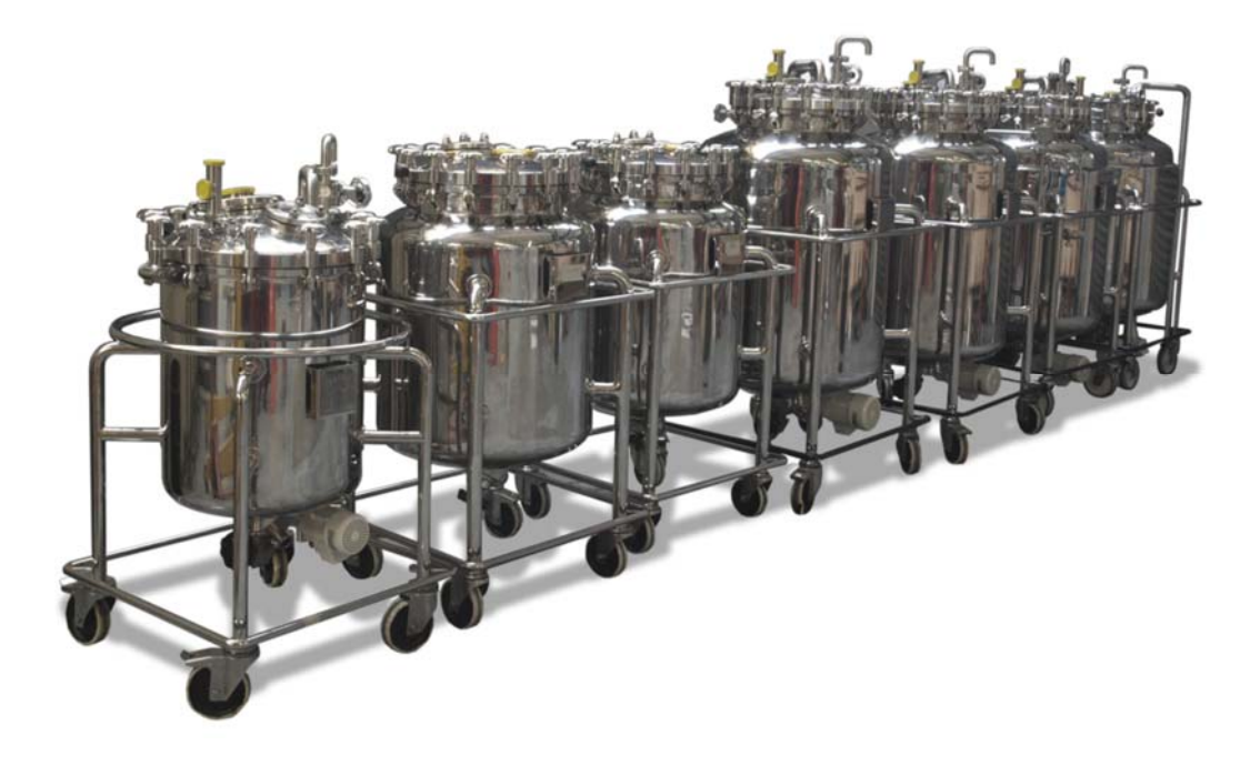
Process Pressure Vessels