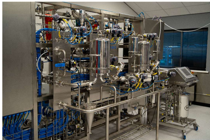
Award Winning Custom Designed Biopharma Filtration Module

For Filtration, Purification and Separation, Process Filtration, Micro Filtration, Ultra Filtration, Nano Filtration, TFF and Reverse Osmosis