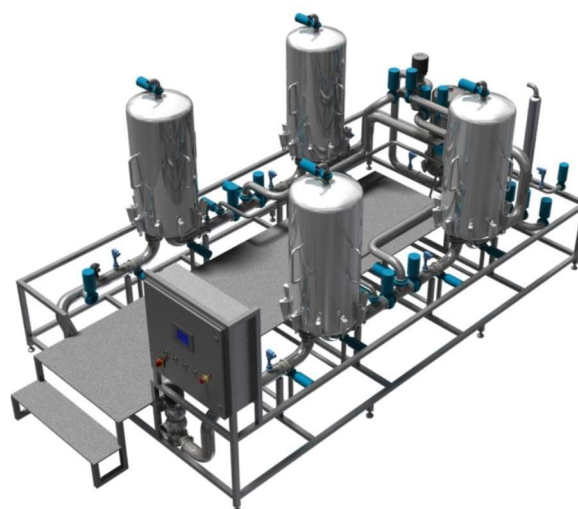
Membrane Filtration Module